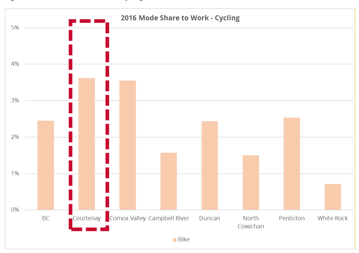
Figure 2: 2016 Mode Share to Work - Cycling

Cycling is already a popular recreational activity in Courtenay, due to the City's natural beauty and great climate. According to Statistics Canada, cycling accounts for 4% of all trips to/from work and school within Courtenay. This is less than half of the target of 10% set by the OCP. As illustrated in Figure 2 , Courtenay's commuting mode share for cycling is the highest among comparable communities in BC.