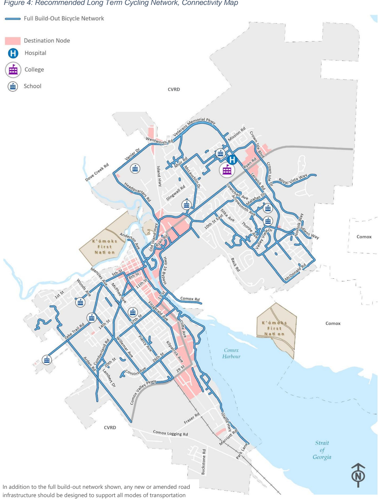
Figure 4: Recommended Long Term Cycling Network, Connectivity Map