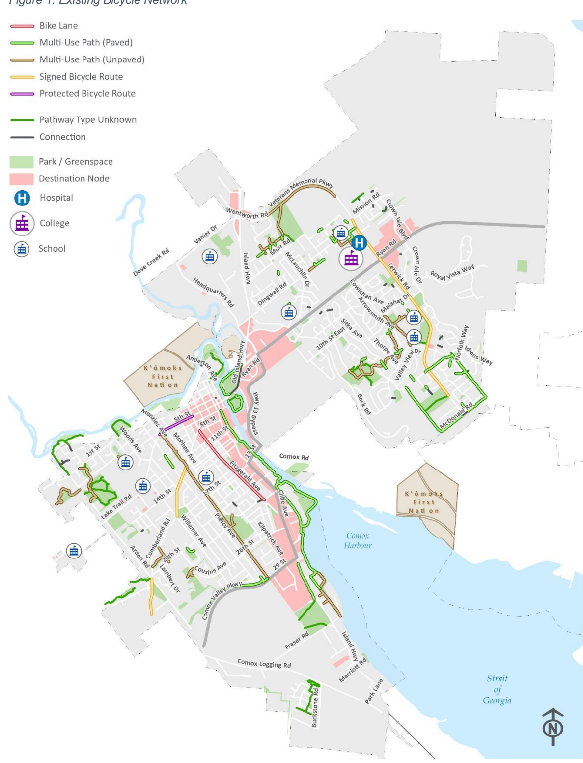
Figure 1: Existing Bicycle Network